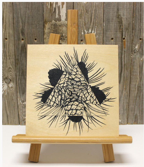
Whitebark Pine by CMB Print Works www.caitlinbodewitz.com